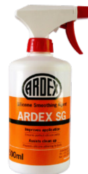
Ardex "SG Spray"