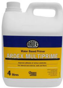
Ardex "Multi Prime"